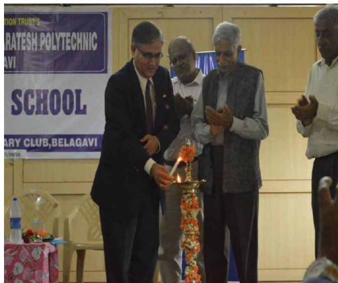
Lighting the Lamp Ceremony by Chief Guest