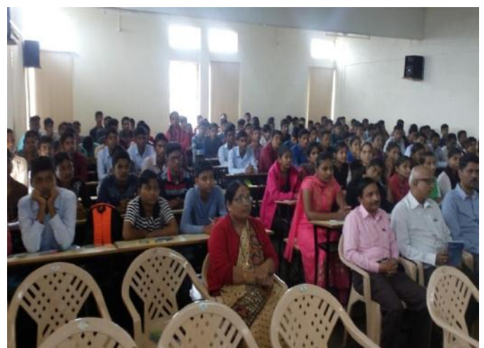
Staff and Students involved the workshop