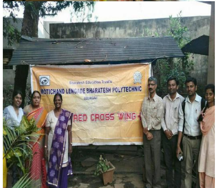
Glimpse of staff members and students at Old Age home