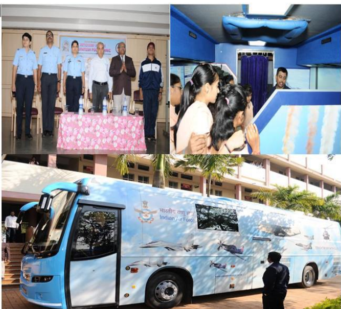
Some of the Glimpse when Indian Airforce Team Visited to the Institute

Under this banner two lectures were conducted as follows.