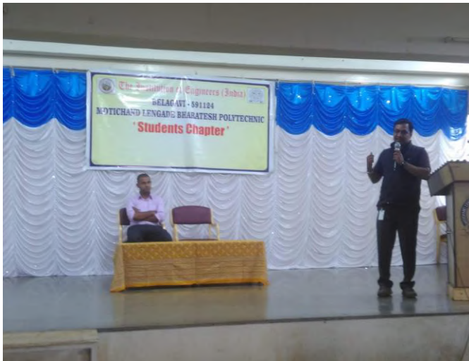
Welcome and Introduction of Guest Lecture