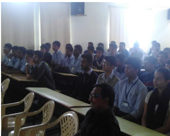
Students Involved In the Session